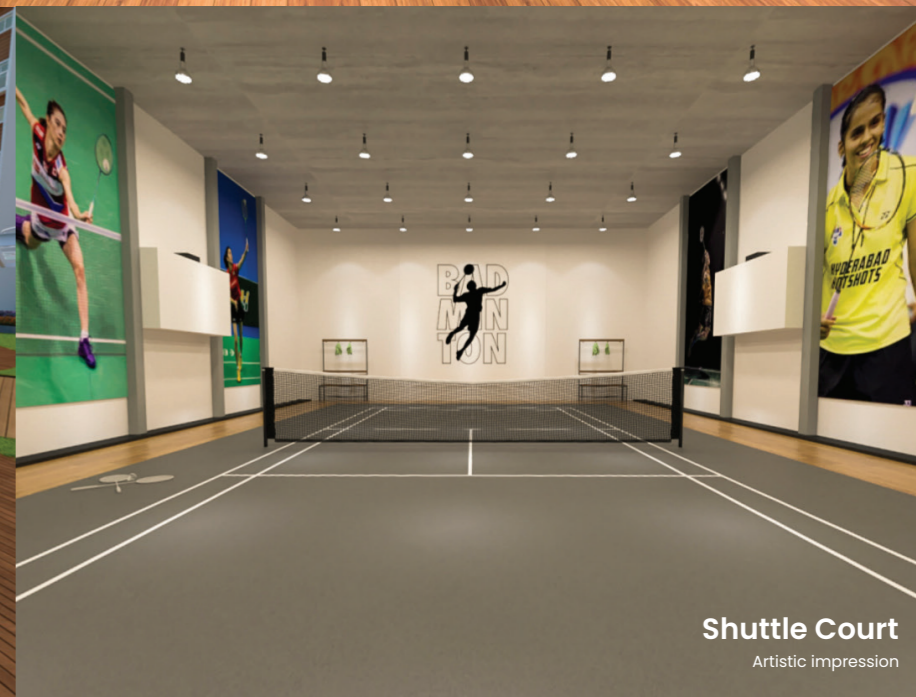
Shuttle Court Artistic impression