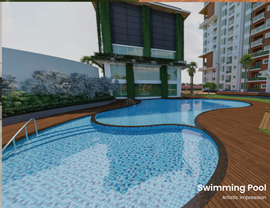
Swimming Pool Artistic impression