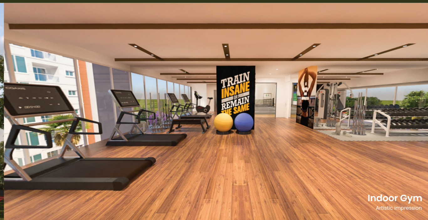
Indoor Gym Artistic impression