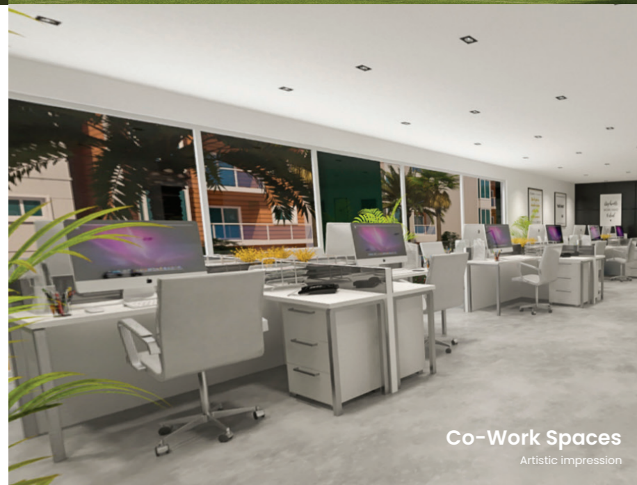
Co-Work Spaces Artistic impression