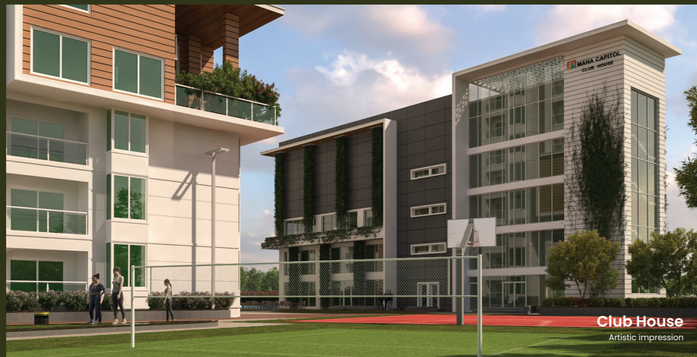
Club House Artistic impression